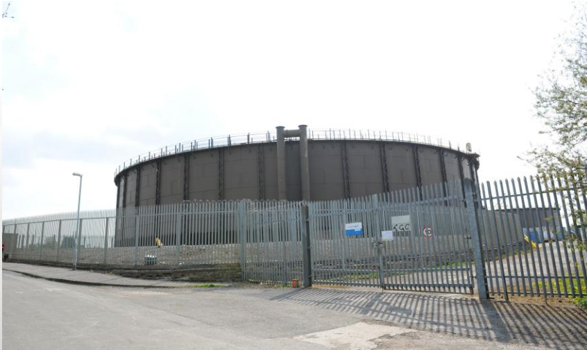
Gas Works, Lostock Hall